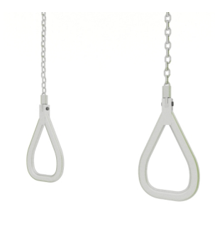
made of stainless steel, preventing fingers from getting caught,