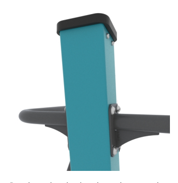
Powder galvanized and powder-coated or stainless steel construction of 100 x 100 mm profile, dulrable end caps on the top of the structure made of plastic,