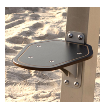
Seats/backrests made of durable HPL plate, resistant to weather conditions,