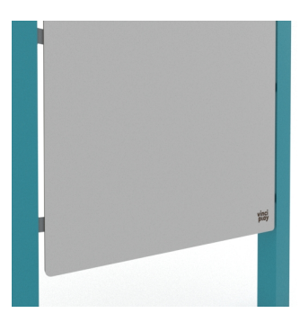
Exercise wall made of durable HPL plate. resistant to weather conditions,