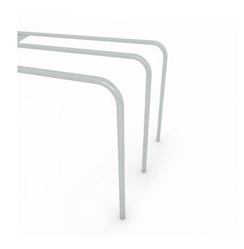
Stainless steel bars with a diameter of 38 Certified handles and calibrated chains mm for a comfortable grip during exercises.