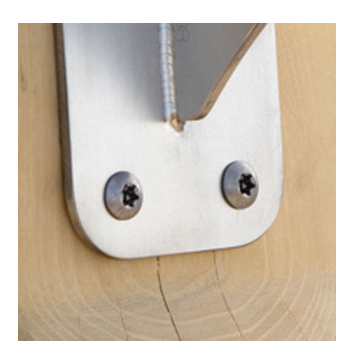
Stainless steel screws and/or screws covered with plastic caps,